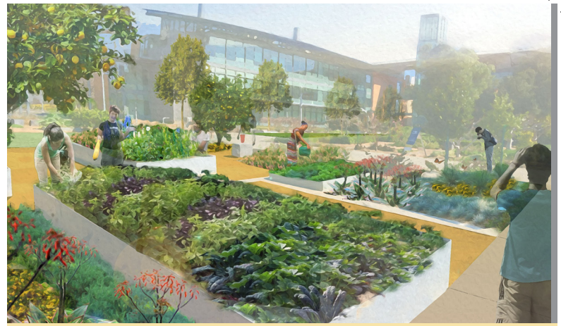
Photorealistic rendering of the future UC Davis Good Life Garden.