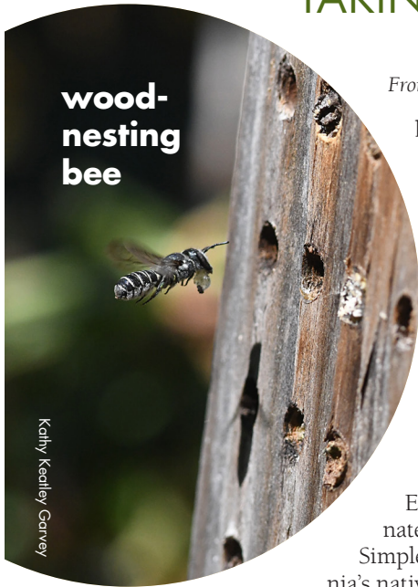
Kathy Keadley Garvey

Even though we may consider our urban and suburban gardens as different from areas designated to conserve habitat, the choices we make as gardeners affect the health of our environment. Simple daily choices can make us part of the solution to providing for the unique needs of California's native bees. Please visit our gardens for inspiration, and check out an amazing palette of pollinator-friendly plants perfect for our region at our upcoming spring plant sales.