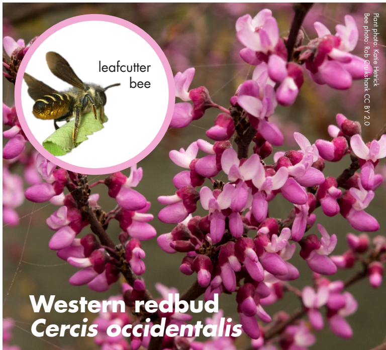
Plant photo: Katie Heinrich Bee photo: Bob Conik's bank CC BY 2.0

is native to the foothills of California's valley floor. It blooms in spring with magenta-pink, pea-shaped flowers that are popular with a variety of native bees. If you see curious scoops on the edges of its leaves, you are doing a good job encouraging diversity in your pollinator garden because that means native leafcutter bees ( Megachile spp.) live close by. Leafcutters nest in wood and use redbud leaves to create walls between their eggs.