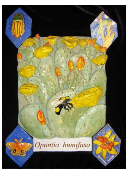
Opuntia plant tile and surrounding insect tiles.

Nature's Gallery, a ceramic mosaic mural composed of 140 hand-crafted ceramic tiles depicting plants and