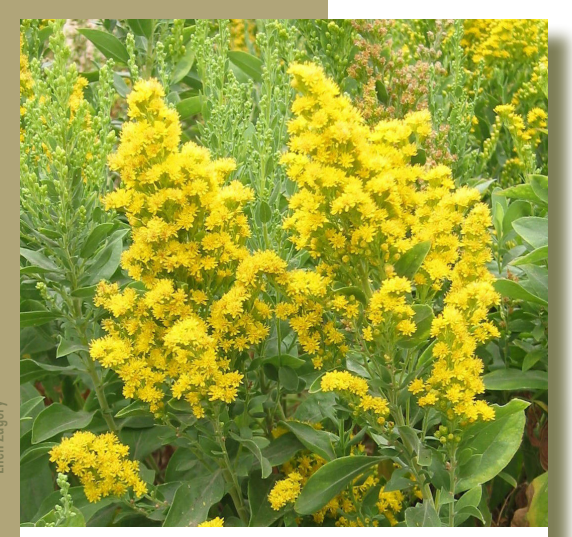
California goldenrod ( Solidago californica 'Cascade Creek') bears bright yellow flowers in summer and fall that attract butterflies and beneficial insects.