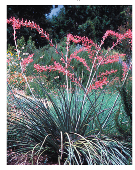
Hesperaloe parviflora, coral yucca

especially showy when the golden flower heads glisten from summer through fall. Hesperaloe parviflora, coral yucca, provides food for hummingbirds all summer long with its large wands of coral flowers. It also adds some architecture to any garden with its strong upright form. Epilobium canum, various cultivars of California fuchsia, makes a great groundcover for