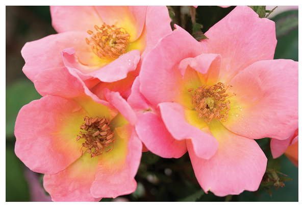
Rainbow Knockout® rose

Along with our wide selection of heirloom roses, we will also have large quantities of new cultivars that will be available in five gallon containers. Rosa 'Radcor' Rainbow Knockout® is a compact landscape shrub rose that is disease resistant and blooms from late spring through late fall. The delicate two-inch