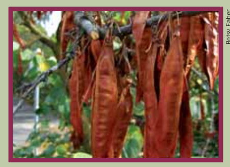
Autumn Seed Pods