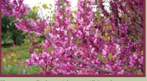
The western redbud is an Arboretum All-Star plant.