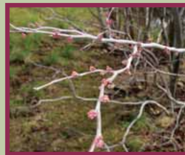
Winter – handsome branch structure